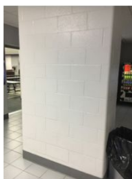
LOCATION (FRHS Gym Lobby)